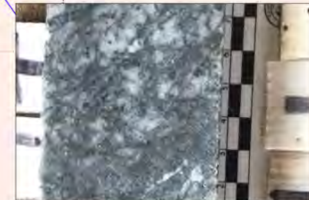
EMD20-111: Eagle-style chlorite and pyrite fractures in granodiorite 94.0m depth ; 1.5m at 3.17 g/t Au