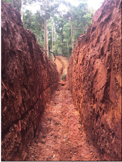
Figure 2 2018 Drilling & Trenching Significant Intersections May 2018